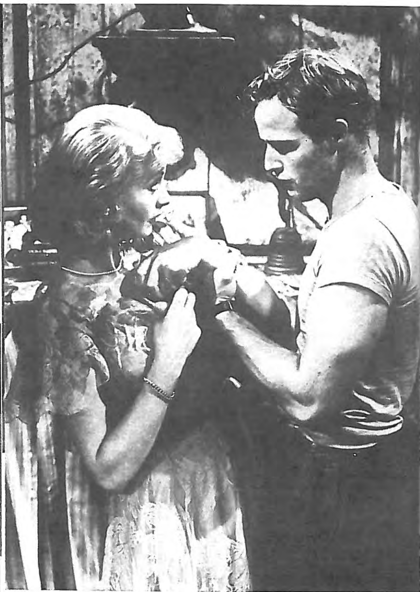
Vivien Leigh as Blanche and Marlon Brando as Stanley in the distinguished 1951 film version of Streetcar , directed by Elia Kazan for Warner Bros. The film won "Best Performance" Oscars for Vivien Leigh, Karl Malden and Kim Hunter.